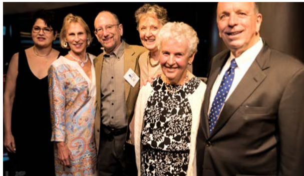
Baltimore Chapter Members Toronto, Canada LEW 2016