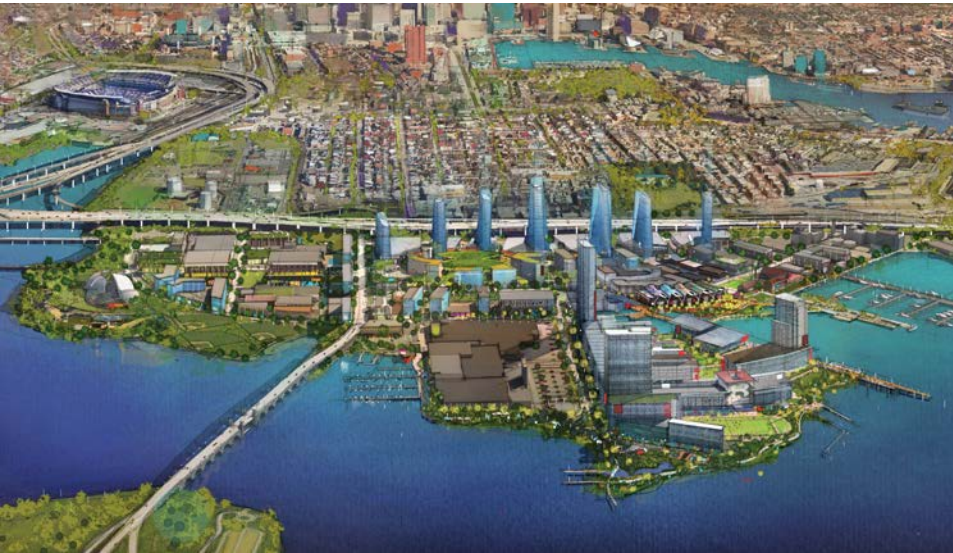
Sagamore Development Baltimore, Maryland KeyNotes – Spring 2017