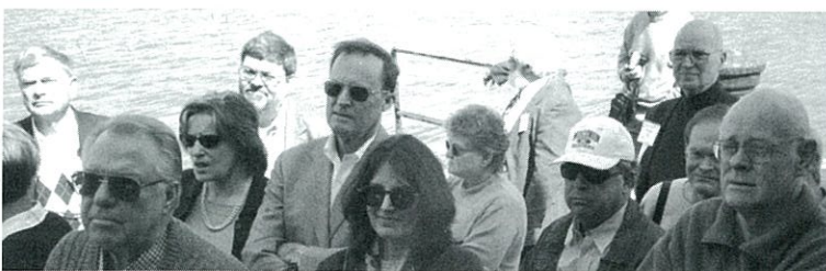
LAI members shown on the chapter tour of the Baltimore Inner Harbor visiting one of the manufacturing facilities being converted into new office building use.

At the completion of the two meetings, the Board of Governors and their guests embarked on a dinner cruise of the Baltimore Inner Harbor area. Saturday, April