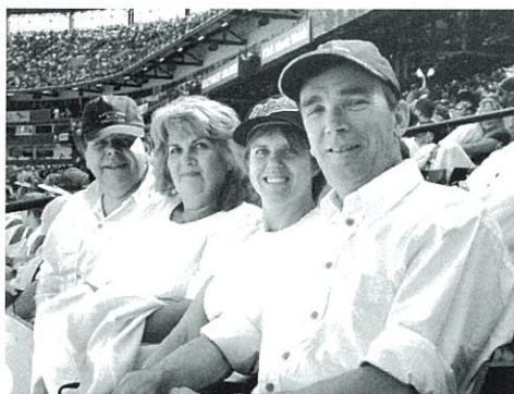
Joining in the last event in the Baltimore "Weekend Experience," were London Chapter visitors enjoying the American "national pastime" at Camden Yards, the new downtown home of the Baltimore Orioles, and cheered on the home team.

Two upcoming "Weekend Experiences"—Chicago, October 26–28, 2000, and San Francisco, April 2001 (date to be finalized). Mark your calendars and plan on attending these opportunities to get to know more about two really great cities!